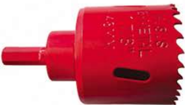
Shank: 3/8" (9.5mm)