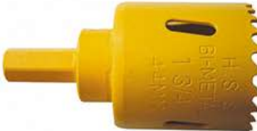
Shank: 7/16" (11.1mm)